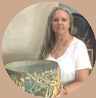
BY MEGAN SHAWKEY created with Mid-Fire Glazes (Blackened Copper + Basque Green)