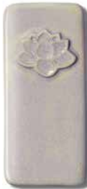
Champagne Quartz 002119