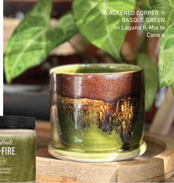
BLACKENED COPPER + BASQUE GREEN on Laguna B-Mix to Cone 6

Available in (30) colors in 16oz (473ml) jars. Lead-free and dinnerware-safe when used and fired as recommended.