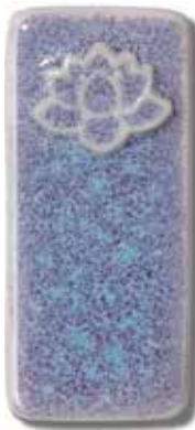
Lavender Mist 002107