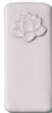
Gossamer Drift 002113