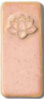
Orange Creamsicle 002129