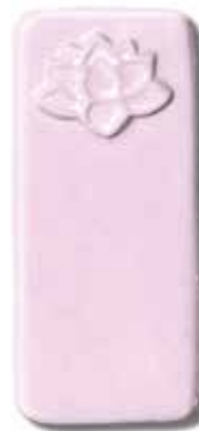
Blushing White 002102