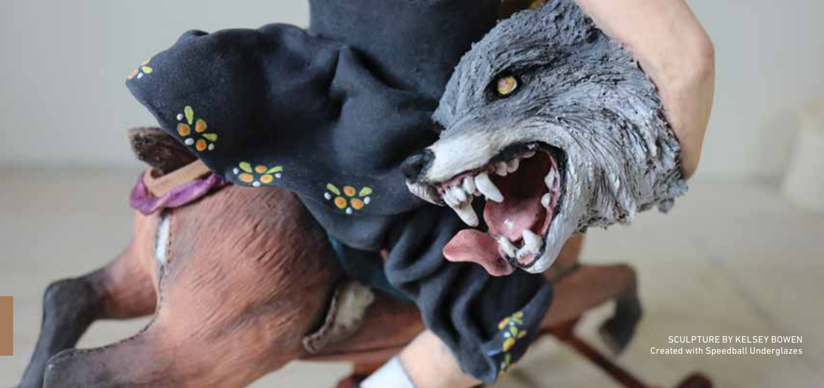
SCULPTURE BY KELSEY BOWEN Created with Speedball Underglazes