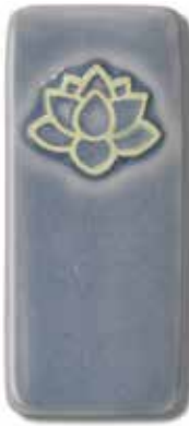
Ethereal Blue 002123