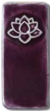
Midnight Plum 002124