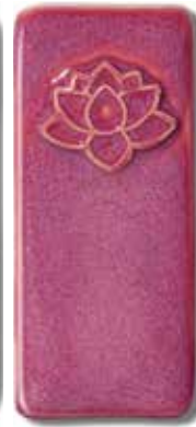
Raspberry Fizz 002130