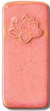
Living Coral 002131