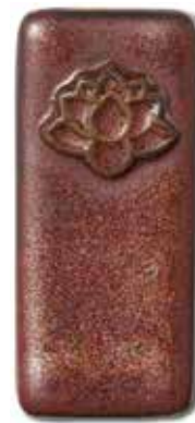
Blackened Copper 002101