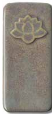
Green Tourmaline 002128