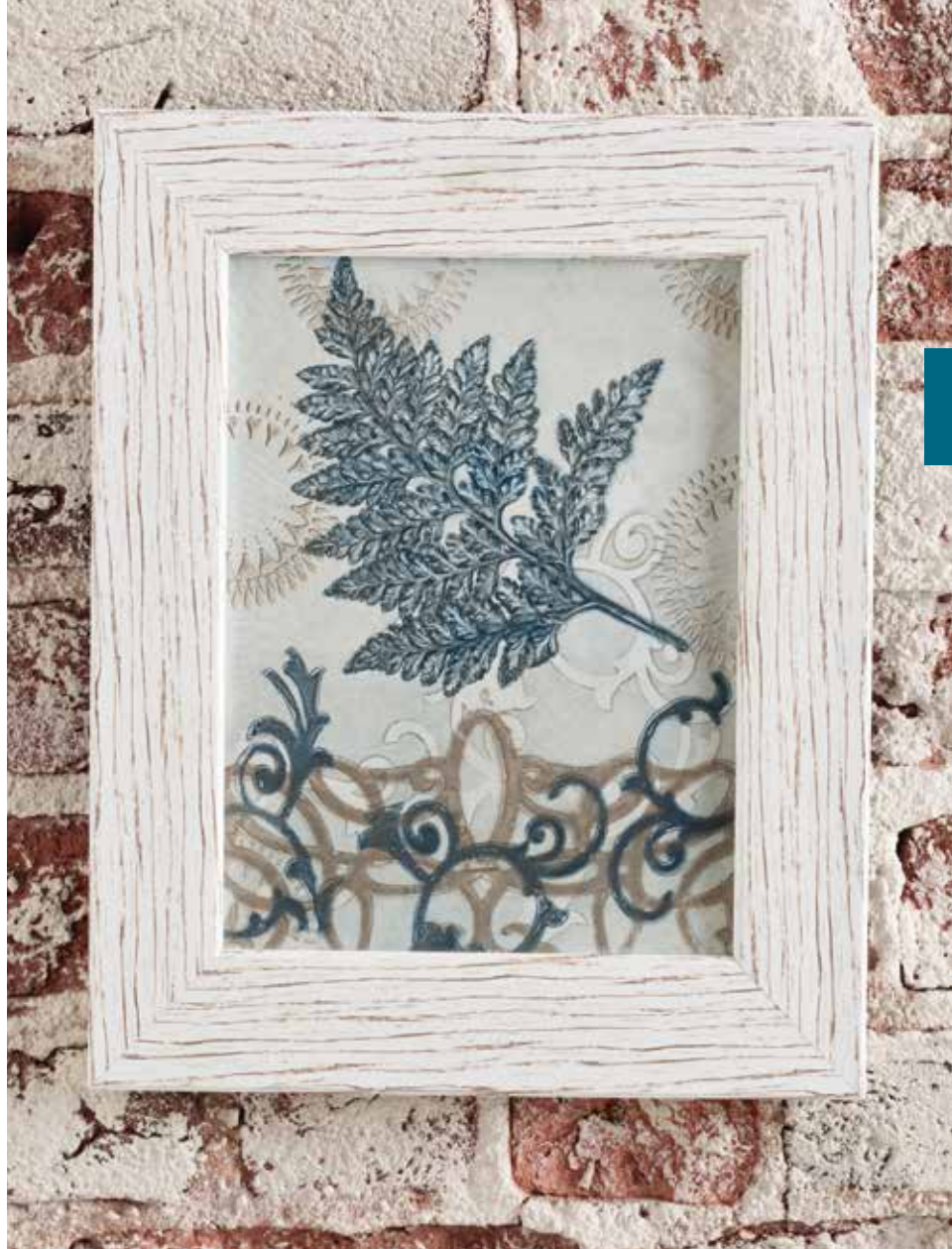
ARTWORK BY: AMY NACK printed with Akua Intaglio® Inks + Gel Plates