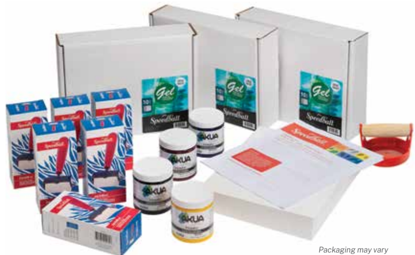
Packaging may vary