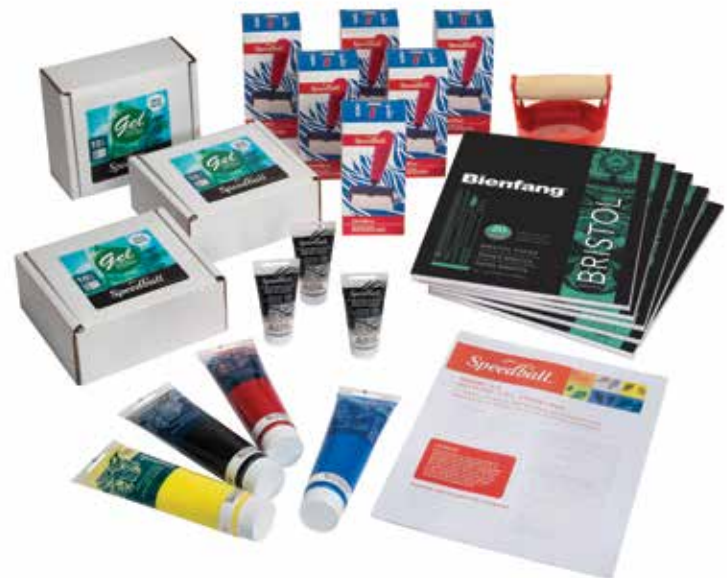
Packaging may vary